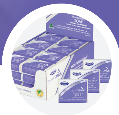
Soap Wraps / Packaging